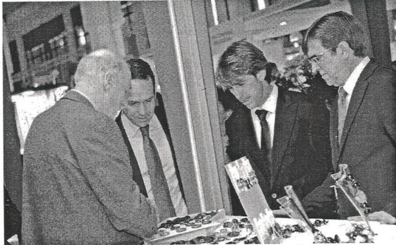
WALKABOUT. The authorities strolled around the stands following the official inauguration

According to information provided by SEBIME yesterday, by 1700 hrs. the number of visitors had already surpassed the figures for the whole of the first day at last year's fair. In addition, the number of buyers who have confirmed that they will be attending EuroBijoux&Mibi has